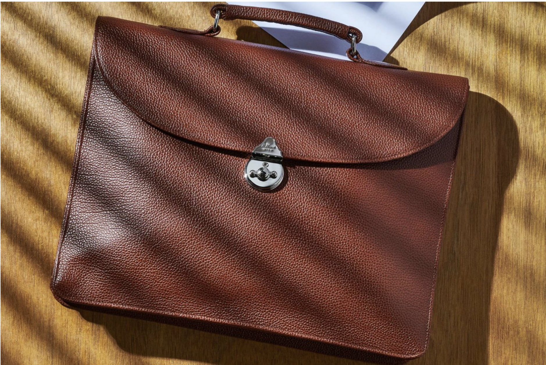
R. Horn’s Wien Pur two-compartment briefcase.